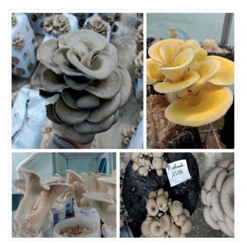
Figure 2. Pleurotus mushrooms (P. ostreatus, P. citrinopileatus, P. eryngii, P. columbinus) -"Mushroom laboratory" - RDIVFG

Mushrooms (Figure 2) began to be used increasingly frequently as dietary supplements in the treatment of various diseases and health problems. Many of these actions and new applications have been developed over the last Edible mushrooms contain highdecades. quality protein that can be synthesized with greater biological efficiency than animal protein. They are high in fiber, minerals, vitamins and have a low crude fat content, with a high amount of polyunsaturated fatty acids relative to total fatty acid content. These qualities are important contributors to mushrooms longstanding status as healthy foods. Macronutrient content of Pleurotus ostreatus are shown in Table 3.