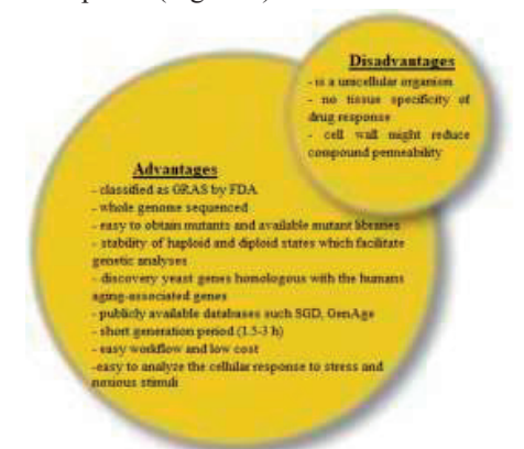
Figure 1. Advantages and disadvantages of using Saccharomyces cerevisiae as a model organism (adapted after Zimmermann et al., 2018) GRAS - Generally Recognized as Safe; FDA - Food and Drug Administration; SGD- Saccharomyces Genome database

articulated points of lack of consensus will serve to stimulate further experimentation leading to clarification as other authors have performed before (Longo et al., 2012). There are more advantages than disadvantages in using yeast S. cerevisiae as a model organism in demonstrating the anti-aging effects of certain plants (Figure 1).