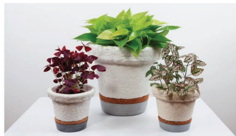
Figure 8. Mycelium based flower pots