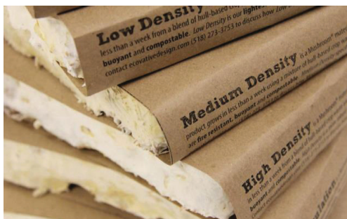
Figure 2. Mycelium based

sandwich panels (Figure 2), decorative products (Figure 3) (Johansson et al., 2012).