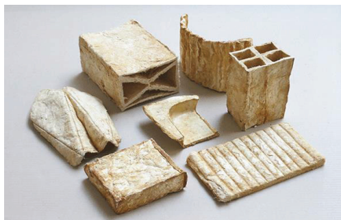
Figure 4. Geometrical formulations of mycelium based structures

mycelium materials which strongly depends on the type of fungi and wastes used, the growing and post-treatment conditions, the design and geometrical shape of enclosure (Figure 4): the material could be frangible and brittle when is too much desiccated (Allan, 2017), fracturing occurring at the boundaries between areas of mycelium growth and undigested wastes, and chemical composition and final morphologies are highly different from substrate to substrate (Mazur, 2017; Travaglini et al., 2017).