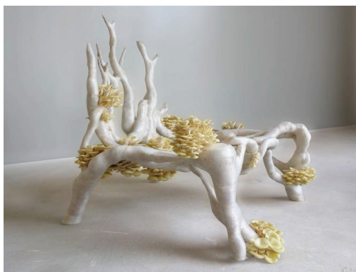
Figure 3. Mycelium based decorative products

Bio-composites based on fungal mycelium are considered to be one of the future generations of renewable materials due to their obvious advantages: rapid growth (approximately 10-14 days) on almost all types of waste transformed into valuable products, organic composition (cellulose, chitin, fats, carbohydrates, various nitrogen species, vitamins and minerals), low costs and broad availability (Vega et al., 2012). More than that, the production of packaging material from mycelia and waste uses 12% of the energy normally required in the manufacture of traditional plastic packaging and reduce carbon emissions by up to 90%. However, the technology is on baby footsteps due to the low reproducibility of the materials created by using biological organisms especially on wastes having variable composition. Also, the most challenging problem remains the final properties of the