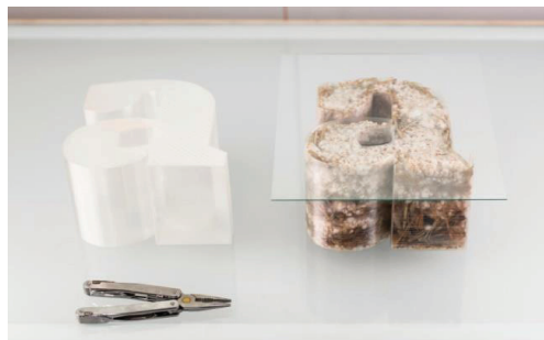
Figure 6. 3D-printed mold for mushrooms growing

materials created by the use of biological organisms on waste with variable composition (Papagianni, 2004). Also, the most difficult problems remain the final properties of materials obtained by fungal mycelium, which strongly depend on the type of used fungi and waste, growth conditions, post-treatment processes, the design and geometric shape of the final enclosures where microbial growth takes places (Figure 6), which can cause several mechanical changes in the final products: chemical composition and final morphologies differ greatly with strain inoculation on various substrates.