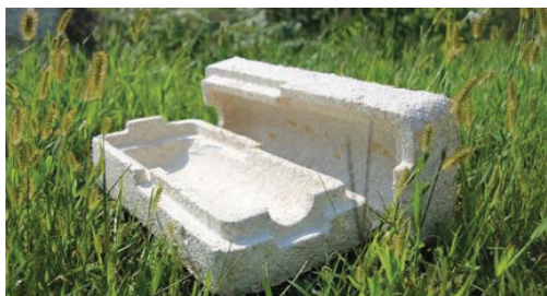
Figure 7. Ecovative Design's proprietary EcoCradle® mycelium-based materials

The key players for bio-plastic packaging materials include Amcor Ltd., Crown Holdings Inc., Bemis Company Inc., Basf SE, Huhtamaki Oyj, Mondi, Sealed Air Corp., Sonoco Products, Saint-Gobain etc. The global production capacity of bio-plastics will increase to about 6.1 million tons in 2021, with packaging accounting for nearly 40% (1.6 million tons) of the total bio-plastics market. Trends show an increase in demand for bio-plastics in the automotive and transport sector (14%, 0.6 million tone) and the construction sector (13%, 0.5 million tons). Even if the benefits of mycelium-based materials are obvious, such as 25% reduction of waste landfills, biodegradability, there are very few companies producing such bio-composites. Ecovative Design, USA, is the leading bio-composites company engaged in research and development of ecological packaging materials (EcoCradle) (Penelope, 2012) by transforming and casting agricultural waste into the required packaging forms using mycelium. Mycological materials are used to package products made by various companies such as Ikea, Dell, Surf Organic Boards and Danielle Trofe Design to develop sustainable surfboards, lampshades and plant pots (Figure 7).