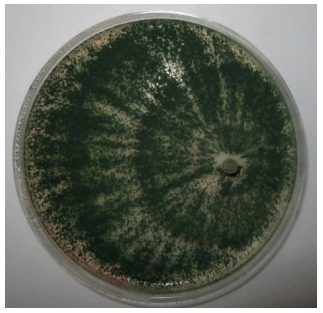
T. asperellum T50 (control)