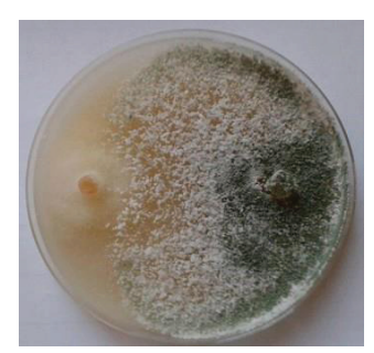
Dual plate culture of T. harzianum T78 and P. parasitica