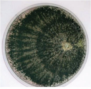
T. asperellum T36 (control)