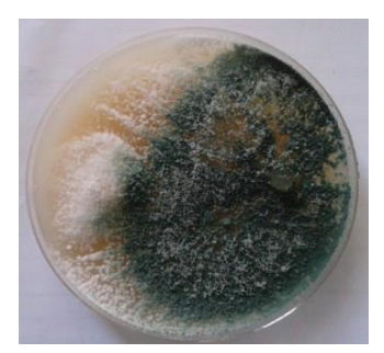
Dual plate culture of T . asperellum T36 and P . parasitica