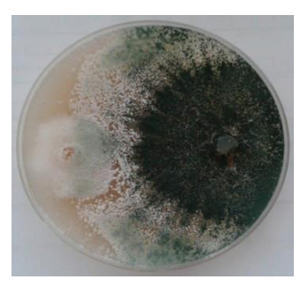
Dual plate culture of T. asperellum T50 and P. parasitica